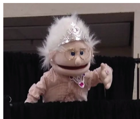
Queen visits for Open the Book