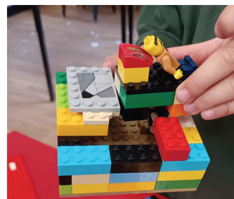
“Build the Bible” Lego Clubs