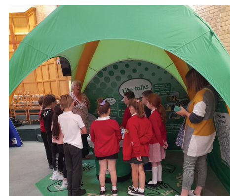
Counties “Life Exhibition” Event