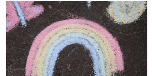
Schools were immediately closed

Welcome to the 2022 ICE Wales Newsletter. This is the first full edition since Jan 2020, just before the pandemic started. This was, of course, a great challenge for us as the schools were immediately closed. What were we to do? Was it the end of ICE Wales and our witness to children in school?